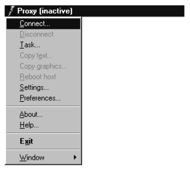
Figure 2-1: The Proxy Control Menu

To issue a Proxy command, simply click the Control Menu button in the upper left corner of the Proxy window, then select the appropriate command.