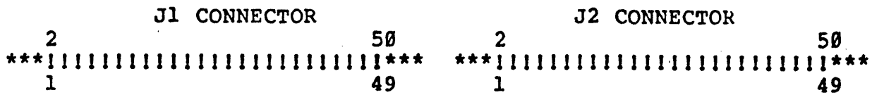
Figure 2 -- Top View of FT-68X Connectors