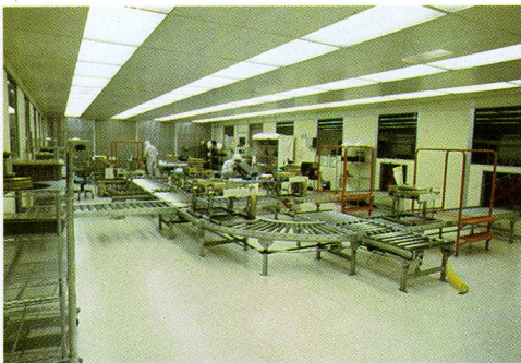
All Model 5380s and 53160s are assembled in Kennedy's 2000 sq. ft. Class 100 clean room.