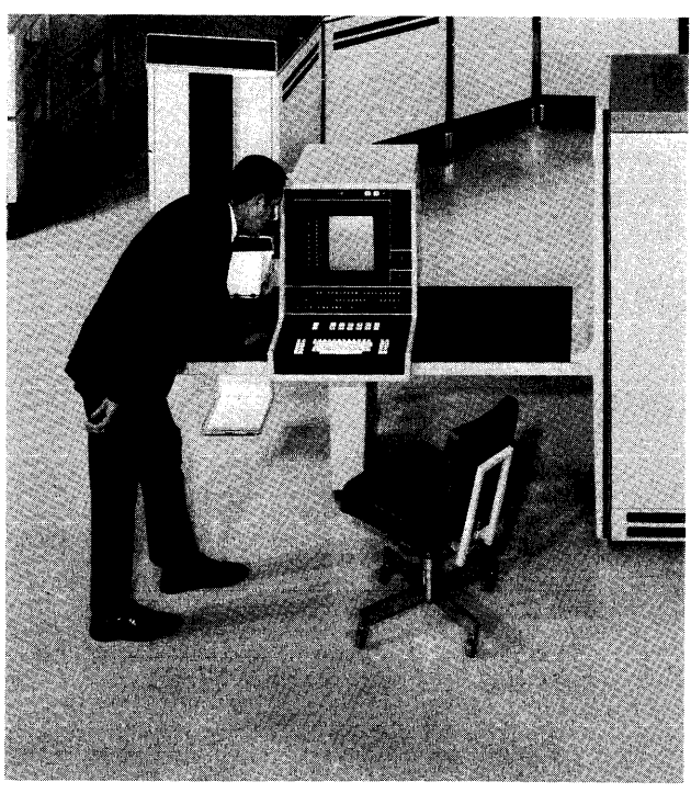
The Century 300's Operator Communication Center, an integral part of the central processor, includes a CRT display, keyboard, printer, and control panel.

360 BAL TRANSLATOR: This program is designed to translate IBM System/360 Basic Assembler Language (BAL) source programs into NEAT/3 source programs that can be compiled and executed on a Century 300. The translator will handle BAL programs that run runder any of the