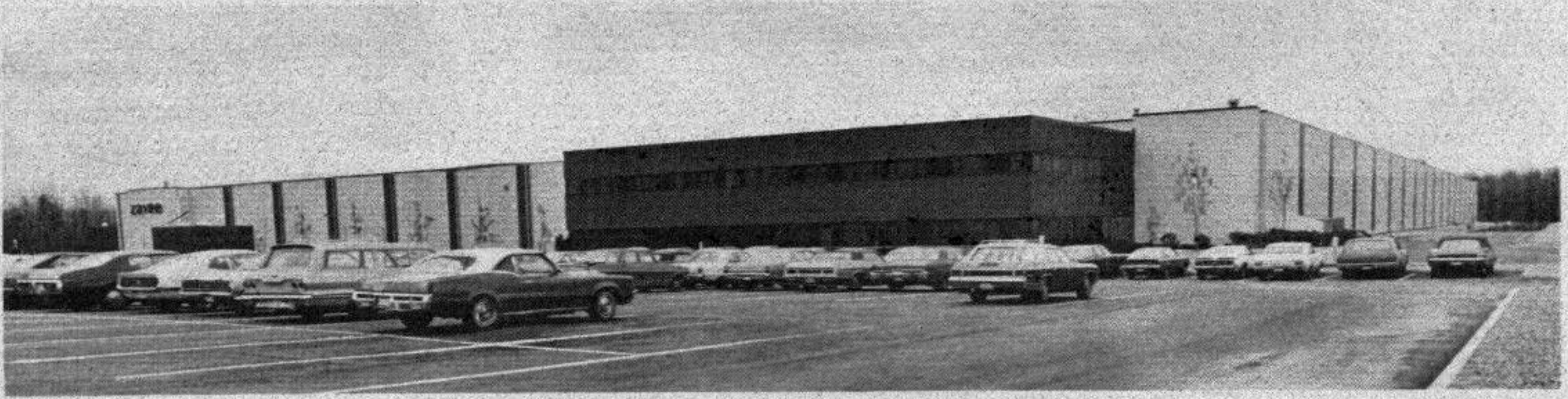
ONE OF THE MANY ZAYRE CORP. DISTRIBUTION CENTERS.