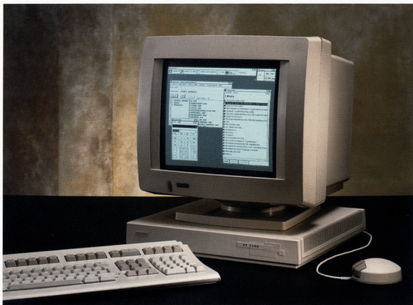
The VT1200 terminal with the 15-inch, VR315 monochrome monitor.