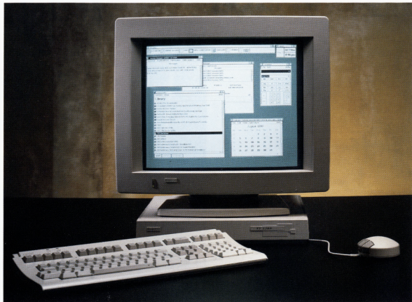
The VT1200 terminal with the 19-inch, VR 319 monochrome monitor.

The VT1200 terminal offers a number of new security features. The "customize" security window enables you to secure that window as well as all terminal manager "customize" windows. The VTE "customize" windows have an additional